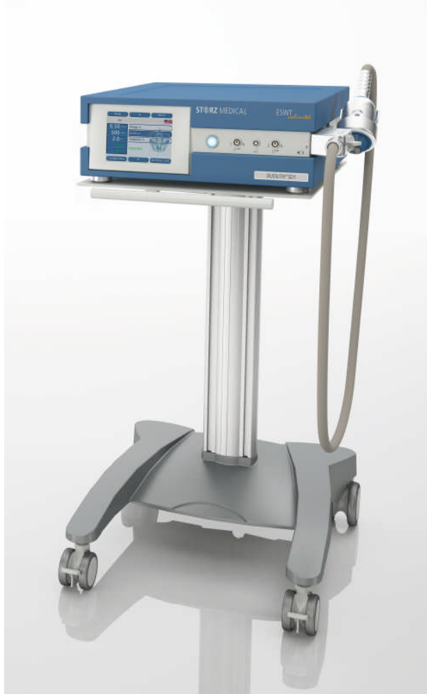
Fig. 1: Shock wave therapy system DUOLITH® SD1 T-Top