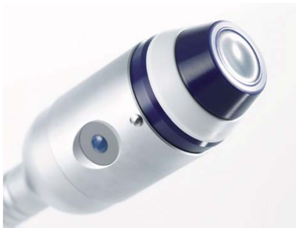
Figure 1. C-Actor handpiece of the Duolith SD1 system.

Three of these patients had received bilateral primary aesthetic augmentation with smooth implants with a volume of 200–240 ml. One patient had undergone unilateral surgery to correct breast asymmetry, while another patient with tuberous breast malformation had received bilateral surgery. In one subject, re-augmentation with smooth implants had been necessary following an infection, while another patient had previously undergone two implant replacements due to the development of capsular