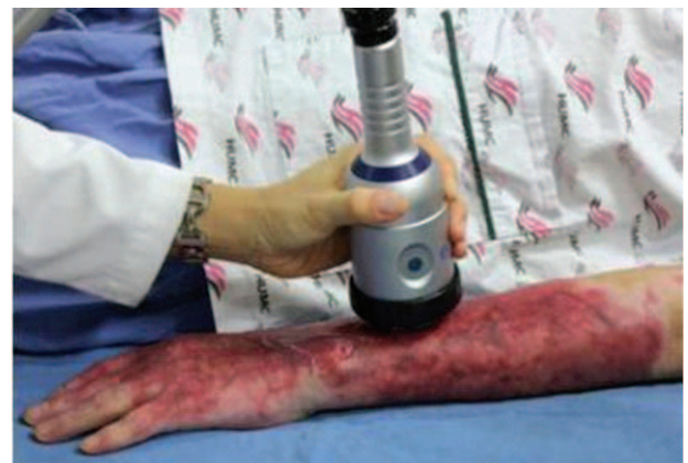
Figure 1. The extracorporeal shock wave therapy was administered to burn patients. The administered shock wave dose was 100 impulses/ \text{cm}^2 (depending on the burn wound surface area) at 0.05 to 0.15 \text{mJ}/\text{mm}^2 with a total of 1000 to 2000 impulses.

ESWT was conducted using the Duolith SD-1 ® device (Storz Medical, Tägerwilten, Switzerland) with an electromagnetic cylindrical coil source of focused shock wave (Fig. 1). Depending on the area where tenderness was palpated, shock wave therapy was performed around the primary treatment site at 100 impulses/ \text{cm}^2 in accordance with a previous study, [11] and depending on the patient's pain tolerance, an energy flux density (EFD) of 0.05 to 0.15 \text{mJ}/\text{mm}^2 , frequency of 4 Hz, and 1000 to