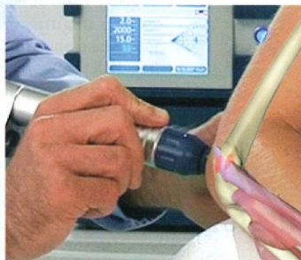
ESWT treatment of the elbow