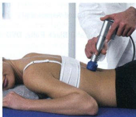
ESWT treatment of trigger points

Chiro Zentrum Zofingen AG Hintere Hauptgasse 9, CH-4800 Zofingen Tel. 062 752 60 60, Fax 062 752 03 03 www.chirozentrum.ch mail@chirozentrum.ch