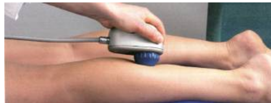
"Treatment using the STORZ MEDICAL V-ACTOR applicator")

is billed privately using the standard IGeL 1 procedure.