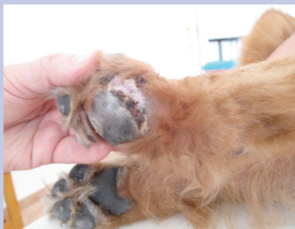
Figure 4. Final result prior to the scab falling off. The entire pad was completely healed, was harder to the touch, and was similar in appearance to the pad on the right leg.

the full body of the pad including the dark/grey outer keratinized epidermis. Treatment was again focused on the perimeter of the growing epidermis and on the few remaining patches of white cell conglomerates in the middle of the remaining red, moist part of the wound. The settings and energy used were: 0.30 mJ/mm 2 at 2 Hz with a total energy of 1.51 Joules (154 shocks) deposited.