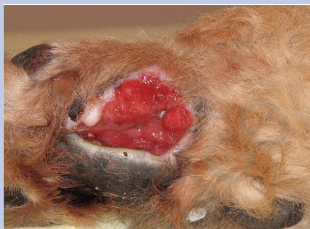
Figure 1. The dog presented with a 4-year-old, non-healing wound.

real shockwave therapy (ESWT) as a “last resort” (Figure 1). Our goal was to attempt to restore the integrity of the blood vascular system in the metacarpal pad and leg using standard ESWT for wounds.