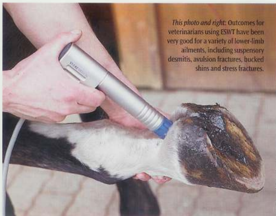
This photo and right: Outcomes for veterinarians using ESWT have been very good for a variety of lower-limb ailments, including suspensory desmitis, avulsion fractures, bucked shins and stress fractures.