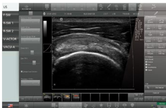
Ultrasound image, lateral shoulder scan