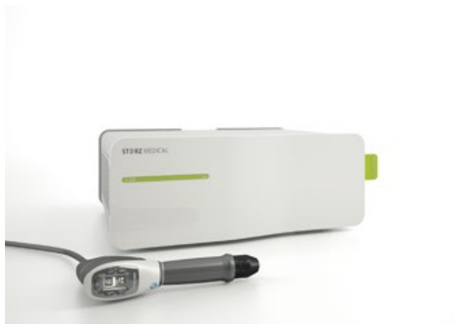
R-SW module with radial FALCON® handpiece