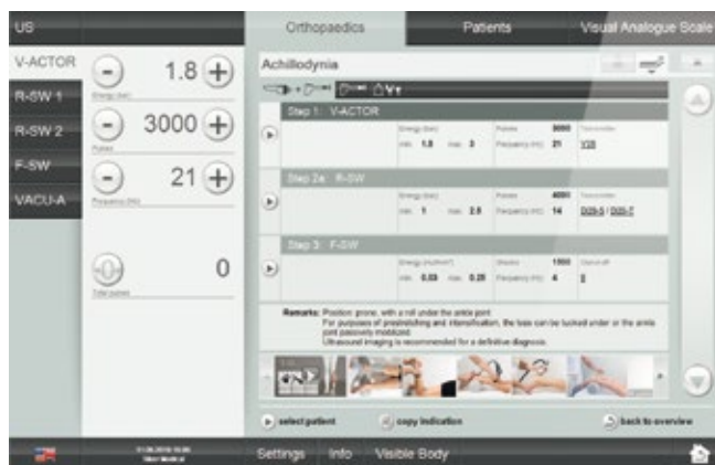
Treatment parameters with application videos