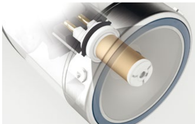
STORZ MEDICAL cylindrical coil