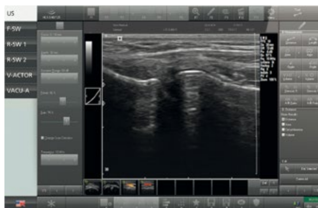
Ultrasound image, elbow