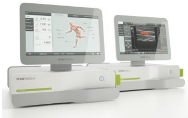
Control unit (15.4" touch screen) with optional diagnostic ultrasound