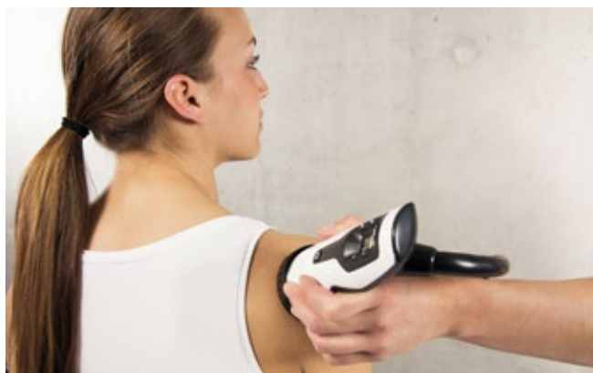
Treatment of shoulder with focused handpiece