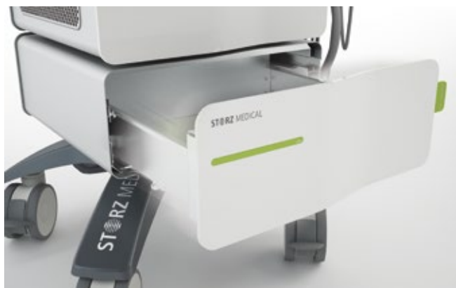
Drawer module »Store Case«