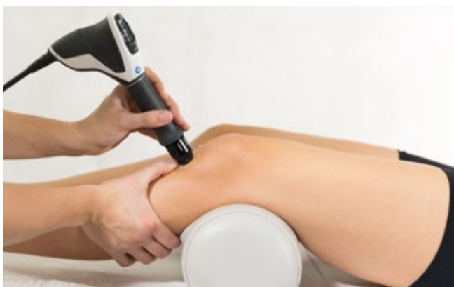
Treatment of knee with radial handpiece